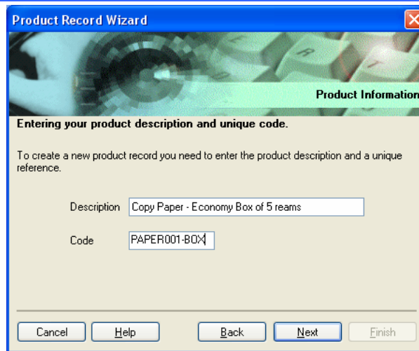
Fig 1 – Add New Product Wizard in Sage Line 50

Click Next twice, and in the sales details screen set the Item Type to 'NON-STOCK'.