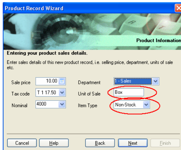
Fig 2, Set the Outer Packaging to be a Non-Stock item

Click Next twice, and in the sales details screen set the Item Type to 'NON-STOCK'.